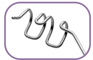
AE-1025 AE-1026 (short)