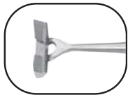
Maloney Astigmatism Axis Marker: AE-2741

Laser lines indicate marking pattern Used with the Beveled Degree Gauge