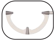
Nuijts/Lane Pre-op Toric Reference Marker: AE-2791TBL

Bubble-level for precise alignment Used temporarily