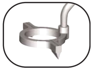
Nuijts/Solomon Toric Axis Marker: AE-2740N

Circular opening for maximum visibility Used with the Beveled Degree Gauge