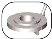
Intra-Op Toric Axis Marker II: AE-2794

Marker and degree gauge in one Cutouts for precise alignment