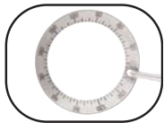
ASICO Beveled Degree Gauge: AE-1590

Beveled design for maximum visibility under the microscope