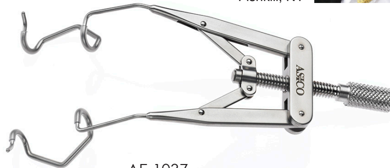
AE-1037 Modi Femtosecond Speculum