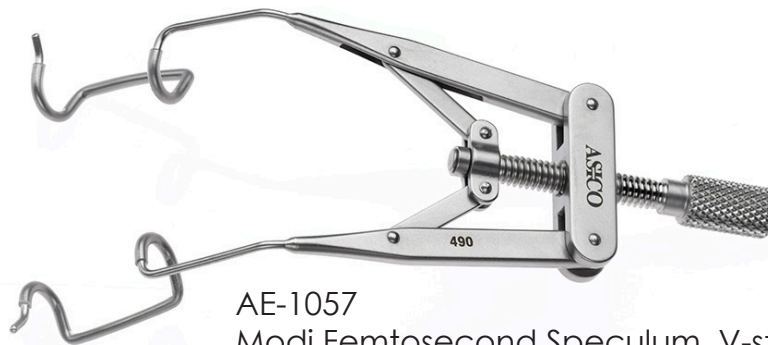
AE-1057 Modi Femtosecond Speculum, V-style